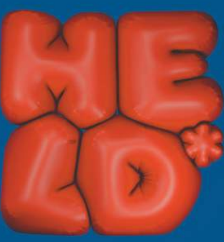
THE HERO PRINCIPLE Of Heroizations and Heroism

Special exhibition June 21 - November 3, 2024